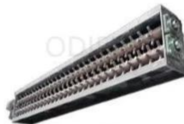
Double Shaft Mixing Conveyor