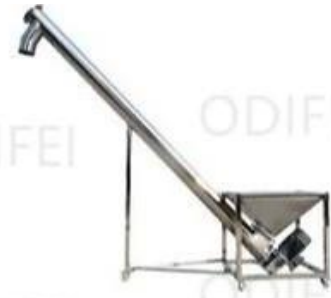
Inclined screw conveyor