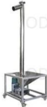
Vertical Screw Conveyor