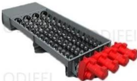
Multi-axis screw conveyor