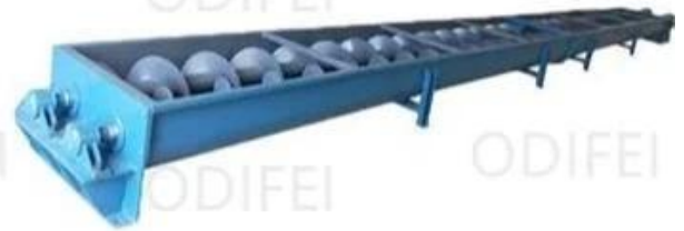
Double shaft screw conveyor