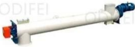
Tubular Screw Conveyor