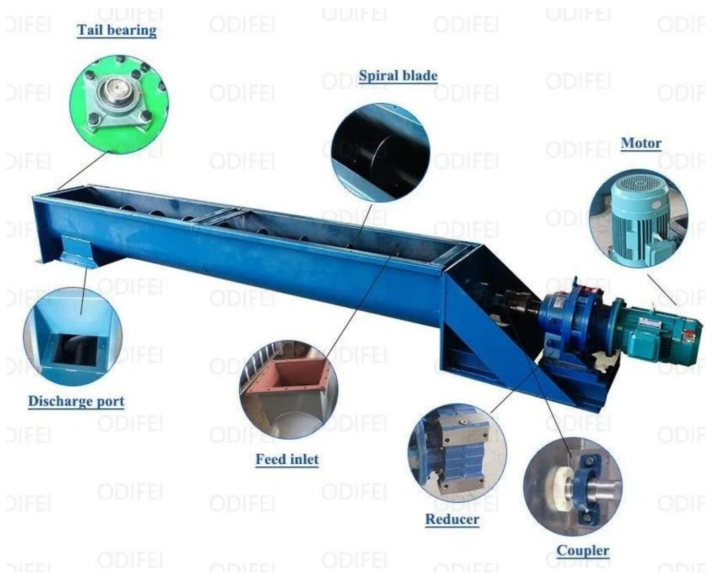
Products picture of the screw conveyor