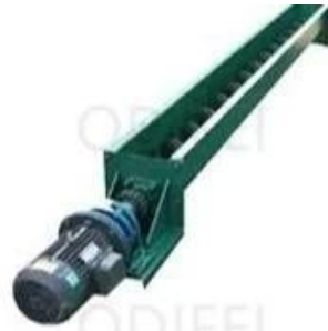
U type screw conveyor