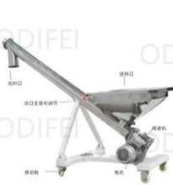
Mobile screw conveyor