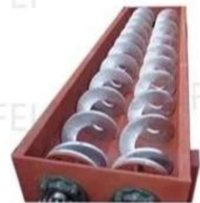
Shaftless Screw Conveyor