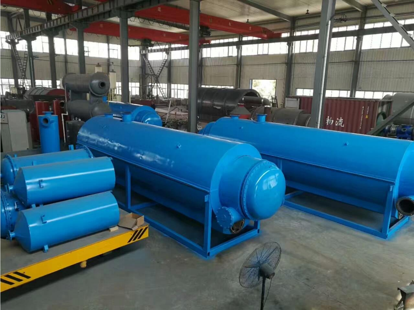
Continuous waste plastic pyrolysis oil equipment factory