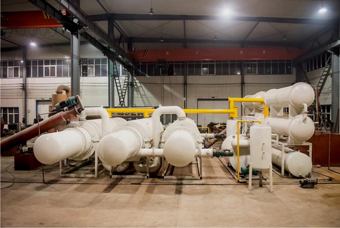
Continuous tyre pyrolysis plant recycling waste tyre machinery equipment