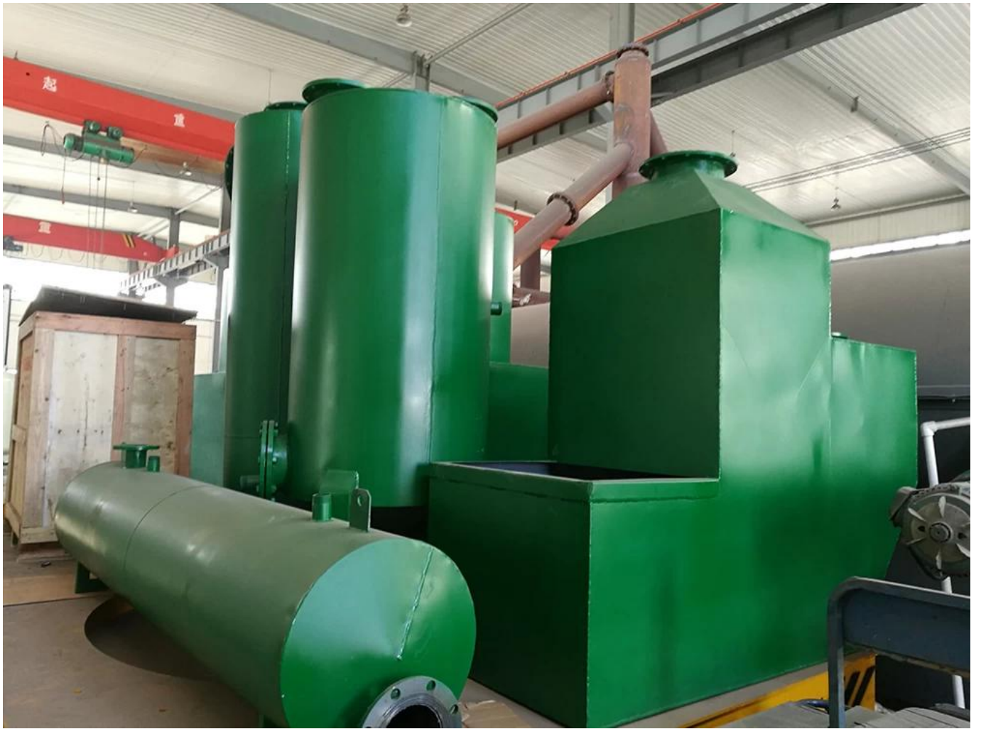
Batch type waste rubber pyrolysis plant