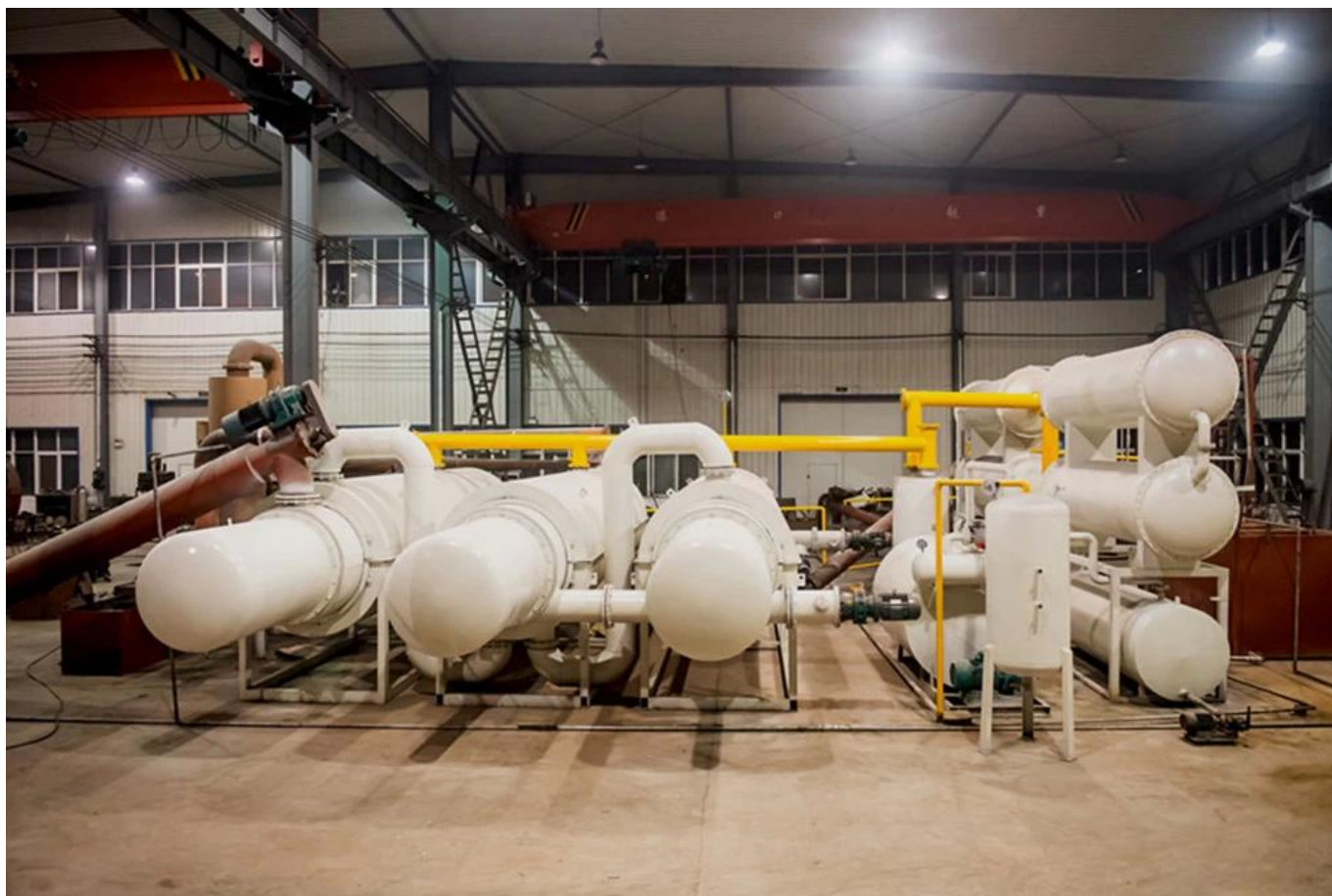
Usine de pyrolyse des plastiques entièrement continue en 2018 recyclée en mazout