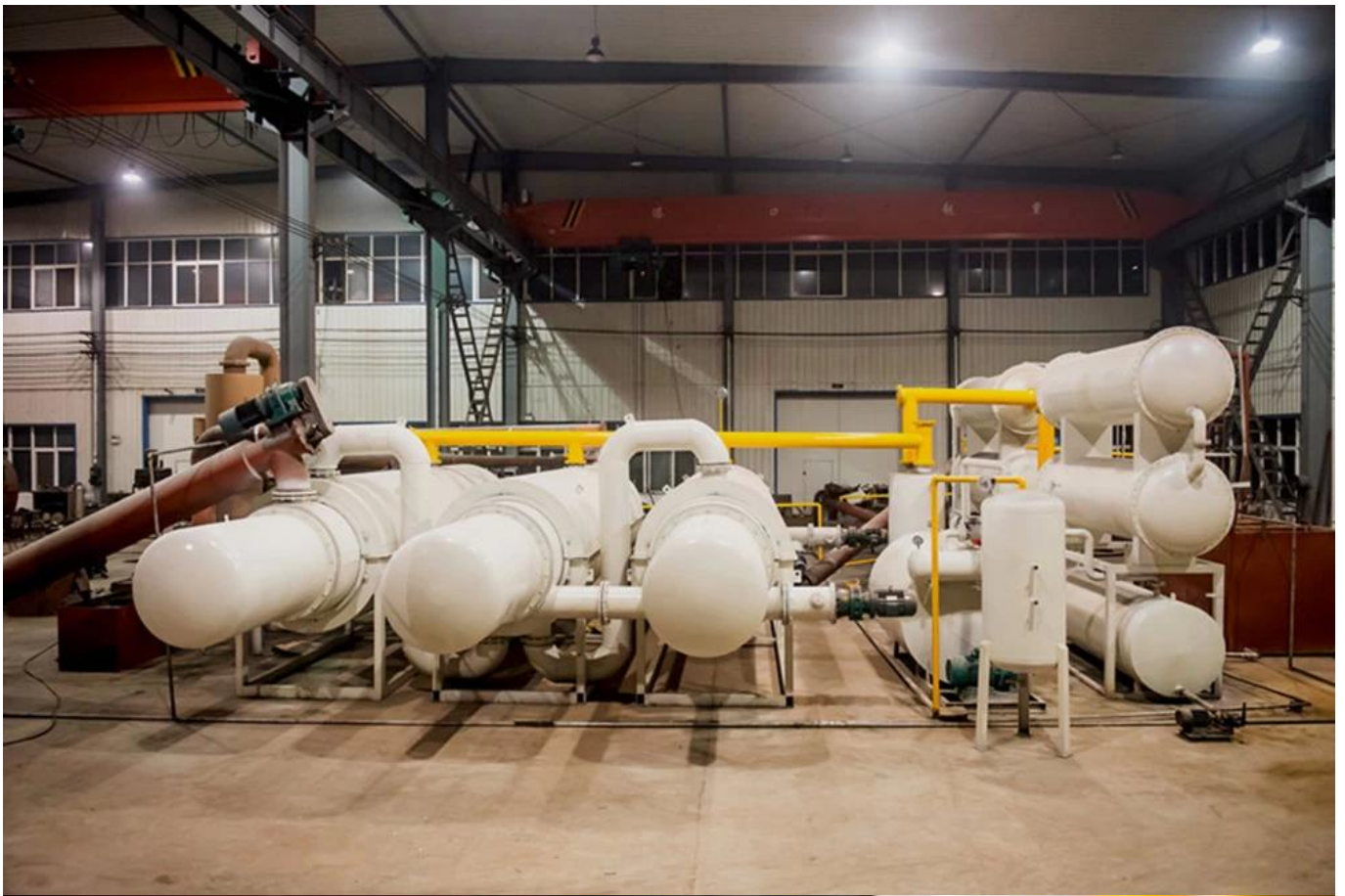
Neumático continuo de pirólisis a planta de reciclaje de aceite.